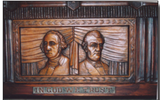
(Washington & Lincoln)

You should remember the first part of that from high school history, if you were paying attention. But enough of a history lesson: go to Google to get the whole story. Don't forget to read about the country's third tallest monument (352 feet) that in 1912—15, was built in Put In Bay to commemorate Perry's victory (I was at the top last week).